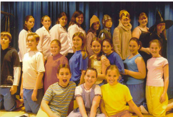
DAPA Cast of 'True Colours'