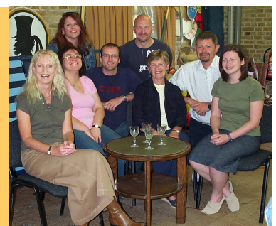
'Kindly leave the Stage' Cast relaxing

Thurs Jan 27th at: 4.30-5.30 Recording Studio